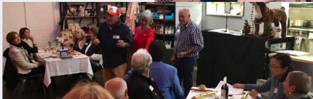
A full photo gallery of the night can be found at

sthubertsisland.nsw.au/events-reports/event-2019-jul-christmas-in-july/