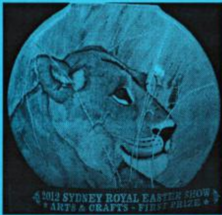
1st Place in Underglaze Painting section with her Vase "African Katz"