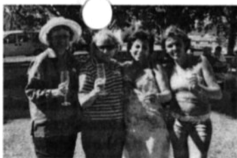
Some of our ladies enjoying a bit of cheer!