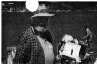
Winner of the giant Christmas Hamper.