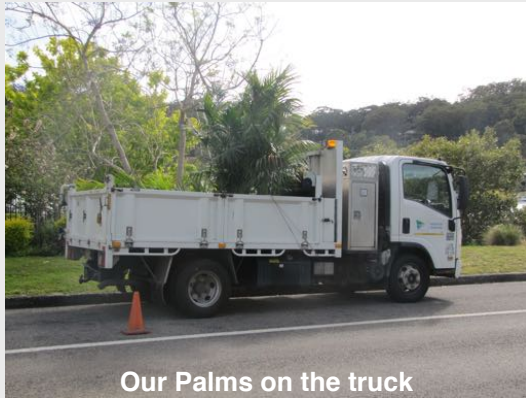
Our Palms on the truck

While mulch has been placed in the extended garden bed initially, the CCC gardeners are looking to place a new ground cover there - several options including pigface were mentioned. There is also a possibility the palms may be staked if needed at a later date. It appears contractors were used in the past to look after our Fan Palms, but we have been told the CCC will probably take over maintenance and care of the new entry gardens. The leading hand gardner I spoke to seem to be very positive in creating and maintaining a healthy, good-looking garden there.