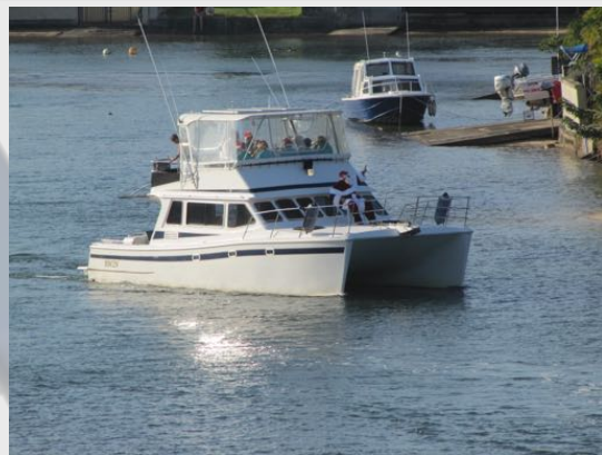
The flotilla supporting Santa formed up in or near Marina Cove then followed the festivities.

A sunnier day than last year saw Rod and Virginia Wenzel's boat, Doctors Orders again hosting Santa on the Water. The boat was loaded with Santa, maybe some reindeer below decks, some hangers-on (carolers?) and the Brisbane Water Brass Band, and set off clockwise around the Island. They did leave dock a little later than planned (an errant musician I heard), but still cruised into all seven of the Island's canals with Santa waving and wishing everyone a "Merry Christmas..." while the brass band played a continual medley of Christmas carols.