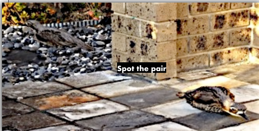
Spot the pair

All us Island residents have heard their call, but maybe not recognised it.