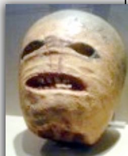
Irish Halloween Turnip

For those lucky people who have given their email address to the Secretary - see Page 3!!