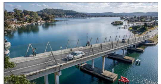
Artist's impression of the completed fence