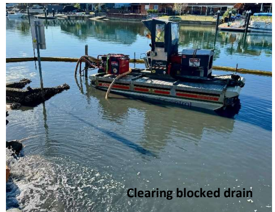
Clearing blocked drain

Pop in and give Lance and Faded Genes your support, and don't forget your dancing shoes.