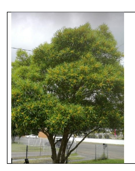
Water Gum - Tristaniopsis laurina

It's toughness helps it to thrive in salty areas along ocean shores Attractive green foliage. Fruit August – October. Flowers November- January.